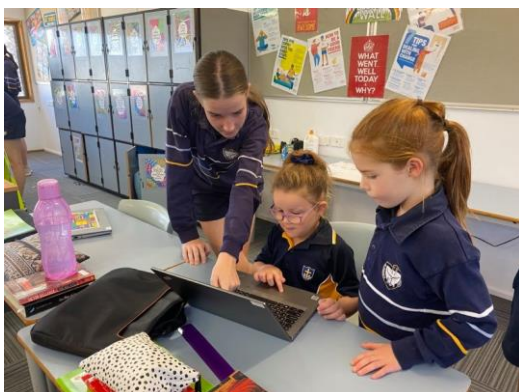
The Year 9B class helping their Year 1/2B Buddy Class to do the Classroom Pulse 'Check In'

Catholic Education SA believes that our role is to help every child to be a thriving person, capable learner and a leader for the world God desires. We believe this Check In will play an important part in supporting that goal and your child. Please do not hesitate to contact the College if you require any further information.